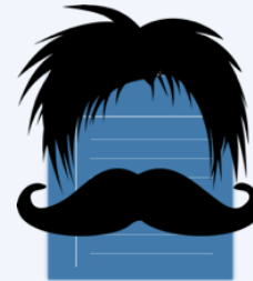
Word processing software