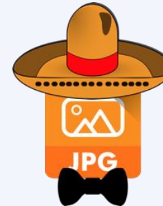
Image editing software